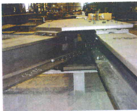
Boeing Corporation has employed FabArc to build the manufacturing facility for their new “Dreamliner model aircraft” ... to accommodate this huge airliner, some trusses are 600 feet long and weigh up to 400 tons.

Don’t get us wrong, FabArc’s work isn’t limited to automotive factories. They have fabricated over 300 medical related projects – ranging from complete hospitals to medical centers to trauma units to university buildings.