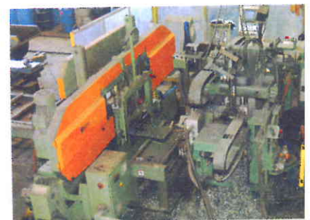
The Peddinghaus 1250 saw/PCD drill tandem installation meets the heaviest production demand, and is a versatile addition to FabArc shop production.