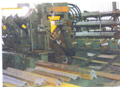
For plate/angle fabrication, the Peddinghaus 823 Anglemaster meets

"Best decision we ever made! The machine paid for itself many times over, and we then learned the future of fabrication lay with automated equipment"