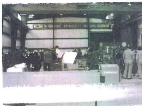
Oktoberfest 1986 in Bradley, IL was when FabArc invested in their first Peddinghaus machine - an Anglemaster AFPS 623.