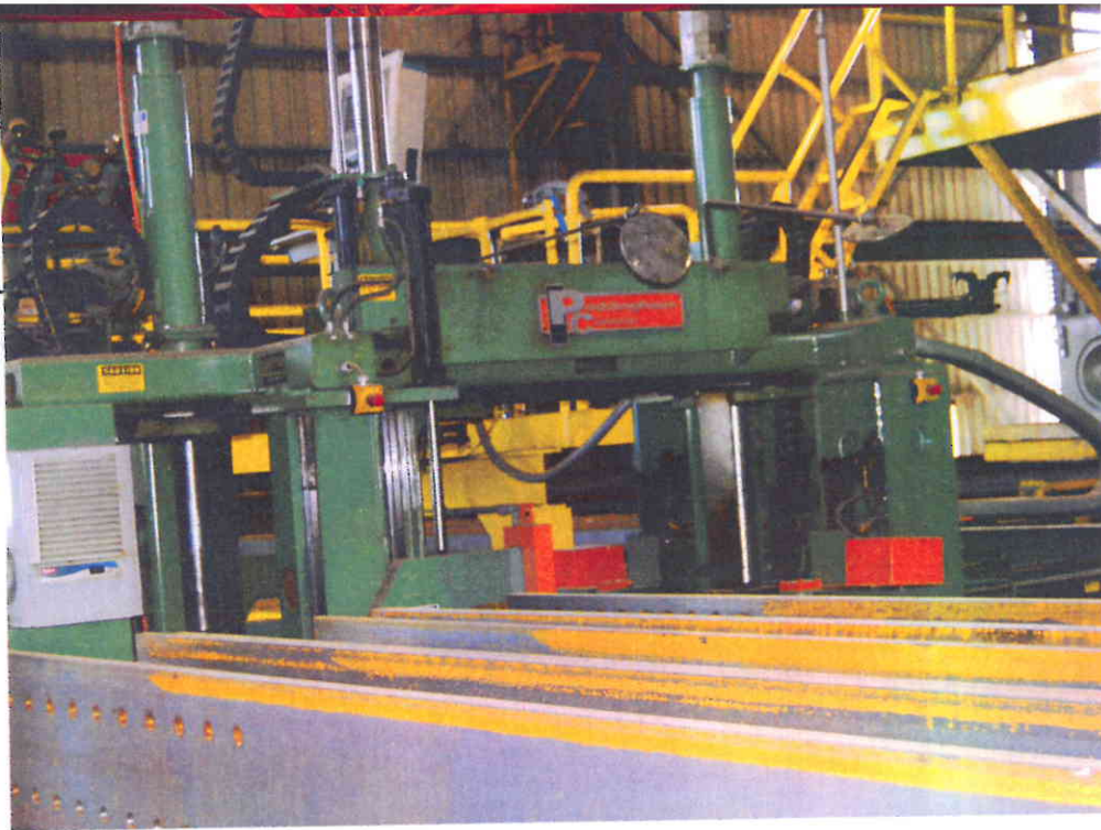
The Peddinghaus ABCM 1250 is one of sixteen (16) Peddinghaus machines installed at FabArc... "automated coping of beams has increased our productivity tenfold..."

Peddinghaus is the perfect partner for FabArc for many reasons: